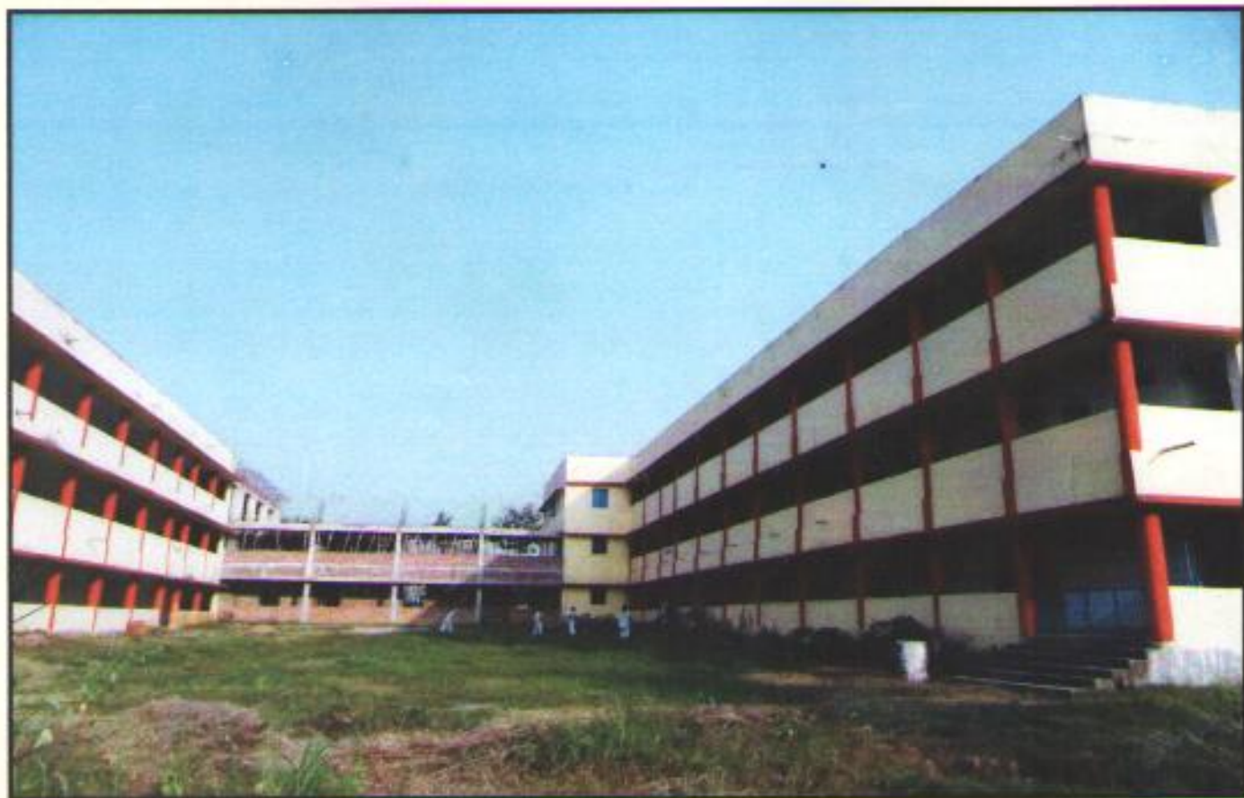
Building of Al-Habeeb Teacher's Training College Sector - VI, Bokaro Steel City - 827006 (Jharkhand)